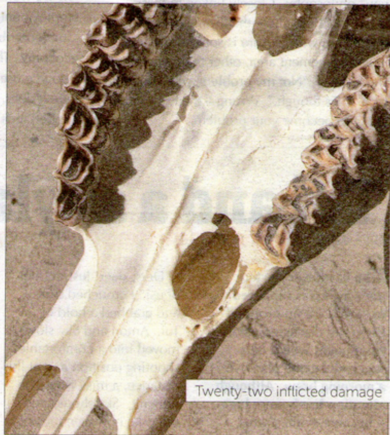
Twenty-two inflicted damage

For the next two weeks, I wandered aimlessly around