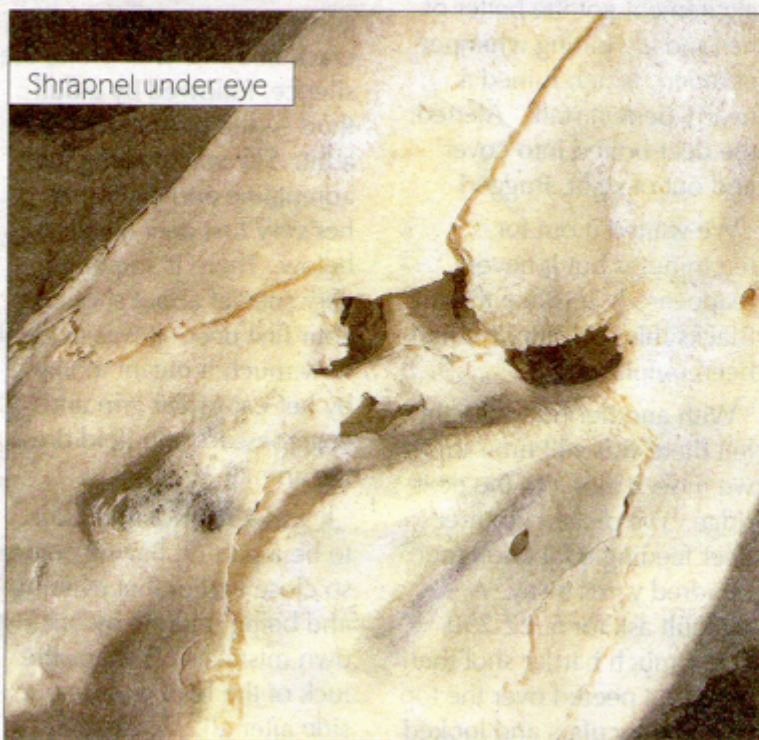
Shrapnel under eye

PS: I will be waiting for you to join me one day, where you to will experience penetration from a sharp object, albeit at the opposite end to where I was injured!