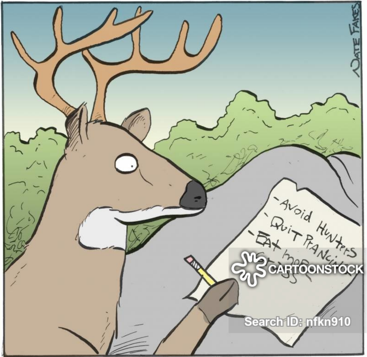
New Deer Resolutions