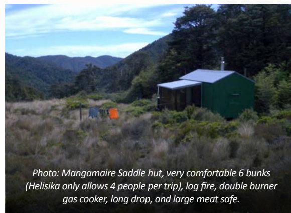
Photo: Mangamaire Saddle hut, very comfortable 6 bunks (Helisika only allows 4 people per trip), log fire, double burner gas cooker, long drop, and large meat safe.

On the 29th we went further down the open valley but had to retreat after a while as the tussock & rolling low bushes were playing hell with Jill's ankles.