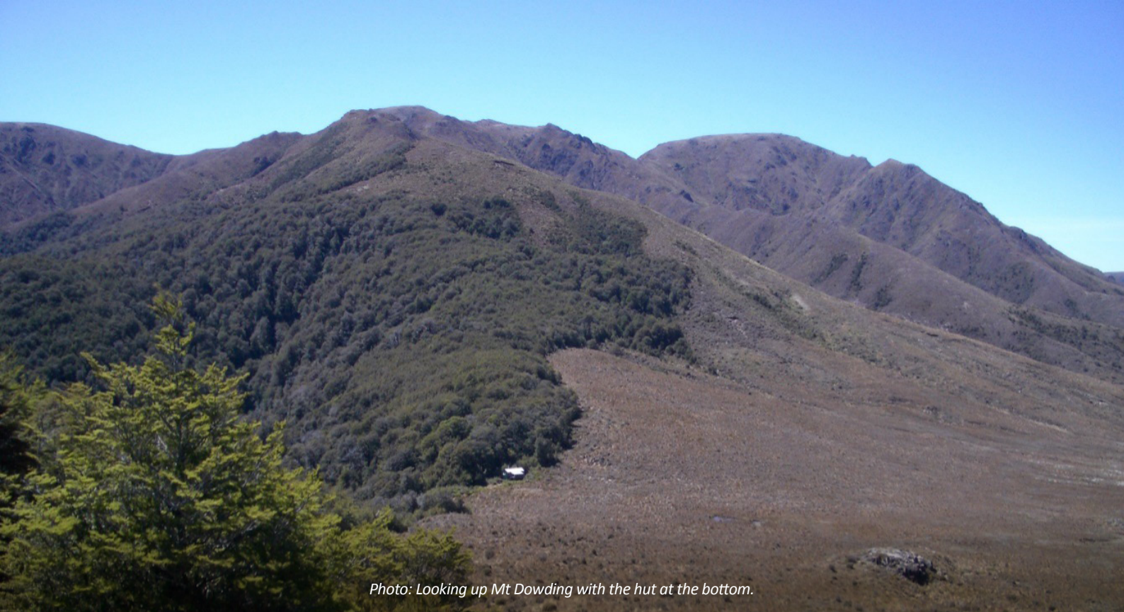
Photo: Looking up Mt Dowding with the hut at the bottom.

The 31st was squally rain so a hut day, which we needed after the big effort the day before.